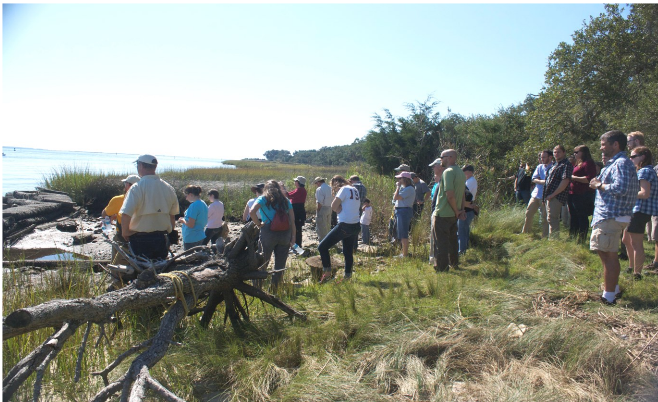
NCAS Members inspect the site of the William Dry wharf on the waterfront at Brunswick Town/Fort Anderson State Historic Site during their tour.