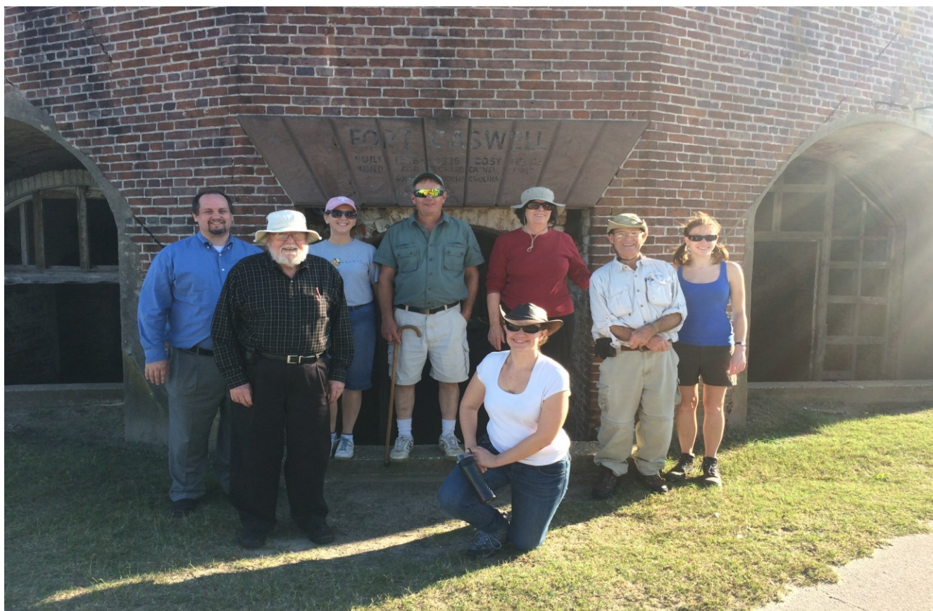
NCAS members who attended the tour of Fort Caswell on Saturday afternoon.