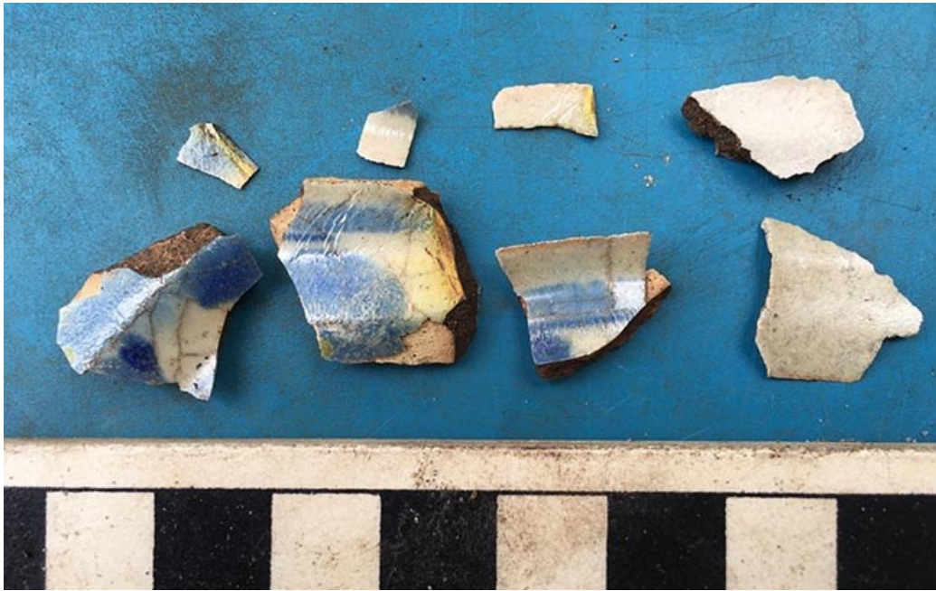
Pottery fragments recently found on Roanoke Island.

Because of the shape and form of the jar, which would have been about the size of a small coffee cup, Deetz said archaeologists can determine that it was not used for domestic purposes like storing or cooking food. And because there were no Europeans settling on Roanoke Island until almost 100 years later, “this absolutely has something to do with Elizabethan occupation of the island.”