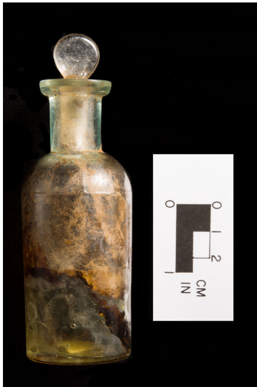
Figure 3. Stoppered medicine bottle containing solidified liquid or syrup. Dated between 1870-1910.