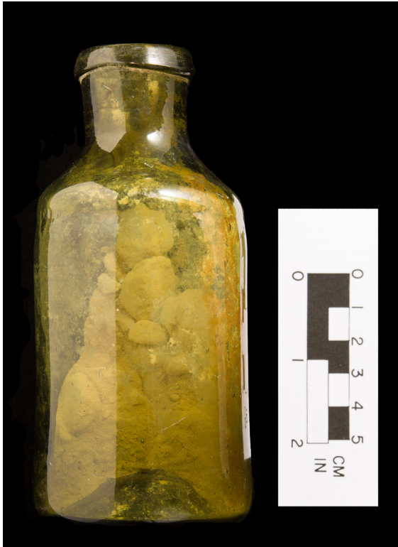
Figure 1. Olive green medicine bottle with white powder residue containing antimony. Dated between 1815-1865.