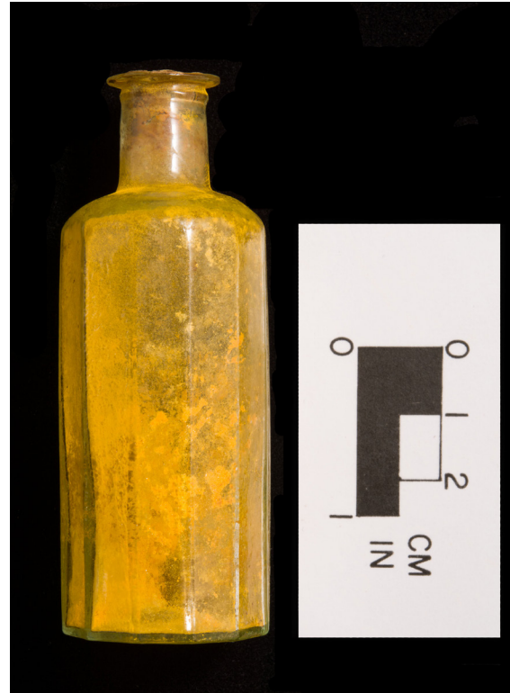
Figure 2. Medicine bottle with yellow powder containing sulfur, iodine, and a lead fragment. Dated between 1845-1865.