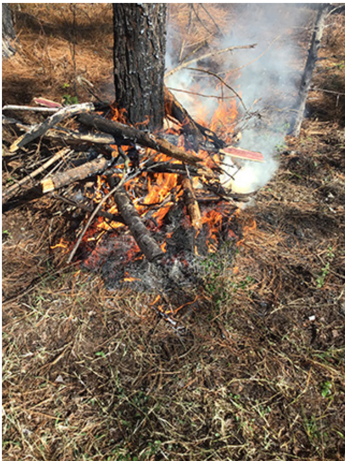
Figure 2. Getting started on the pine.

continued from page 1, Cutting Trees Using Fire