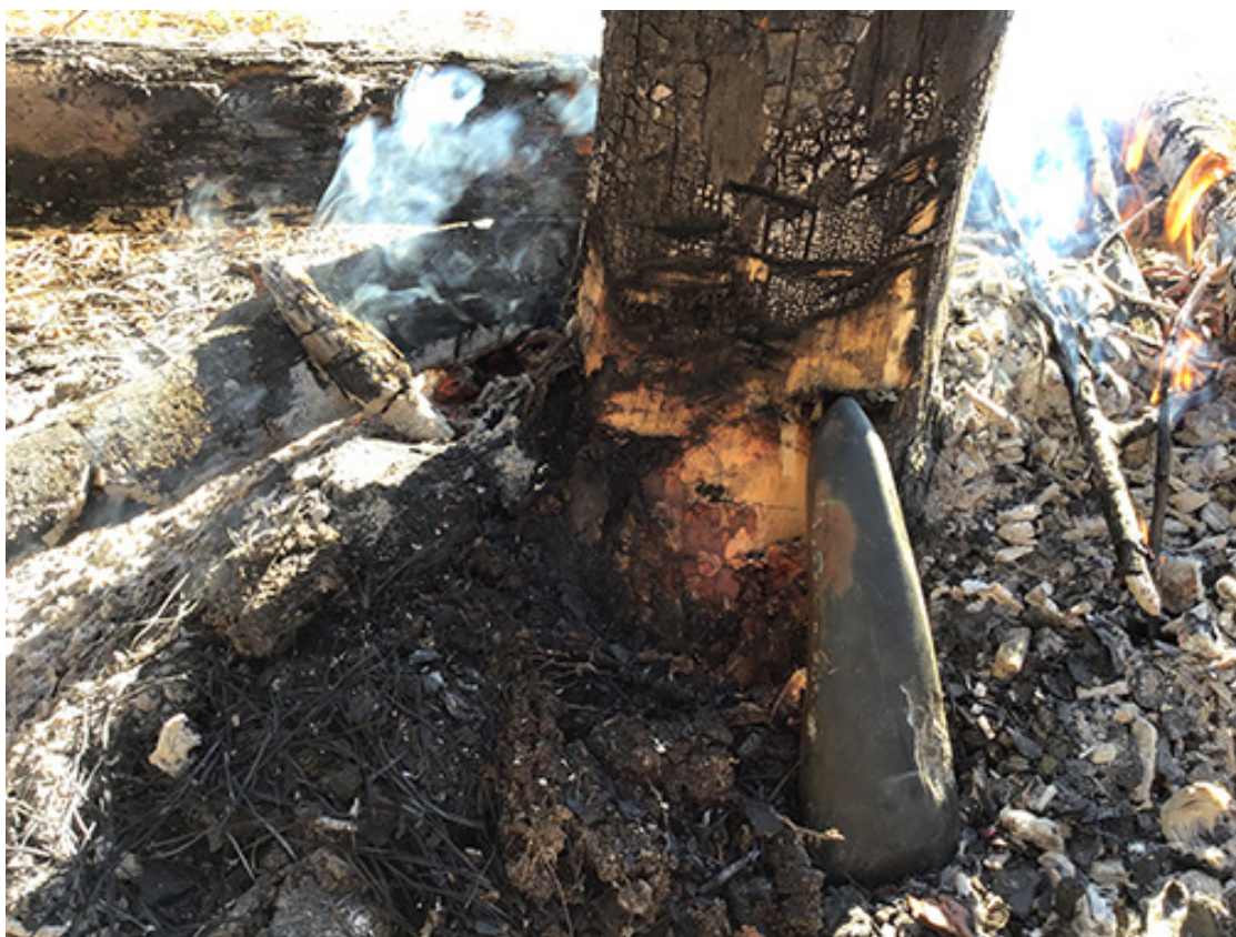
Figure 1. A close-up view of the pine tree and adze.

Town Creek Indian Mound has been experimenting with fire to cut down trees. Two trees were selected for removal, a living pine and a standing but dead ash. Both measured about 8" in diameter near the base. We used a stone adze to remove the bark before building a fire around each tree, which we kept burning for about six hours. The adze was also used to chop while the fire was burning (Figure 1). After the initial burn period, we were able to push over the dead ash but not the living pine tree (see Figures 2-4 on page 2). In addition to a fun experimental archaeology project, the tree felling exercise gave us a first-hand impression of what "fire-finished" cut lumber might have looked like. The knowledge and experience gained will help Town Creek create more historically accurate reconstructions going forward.