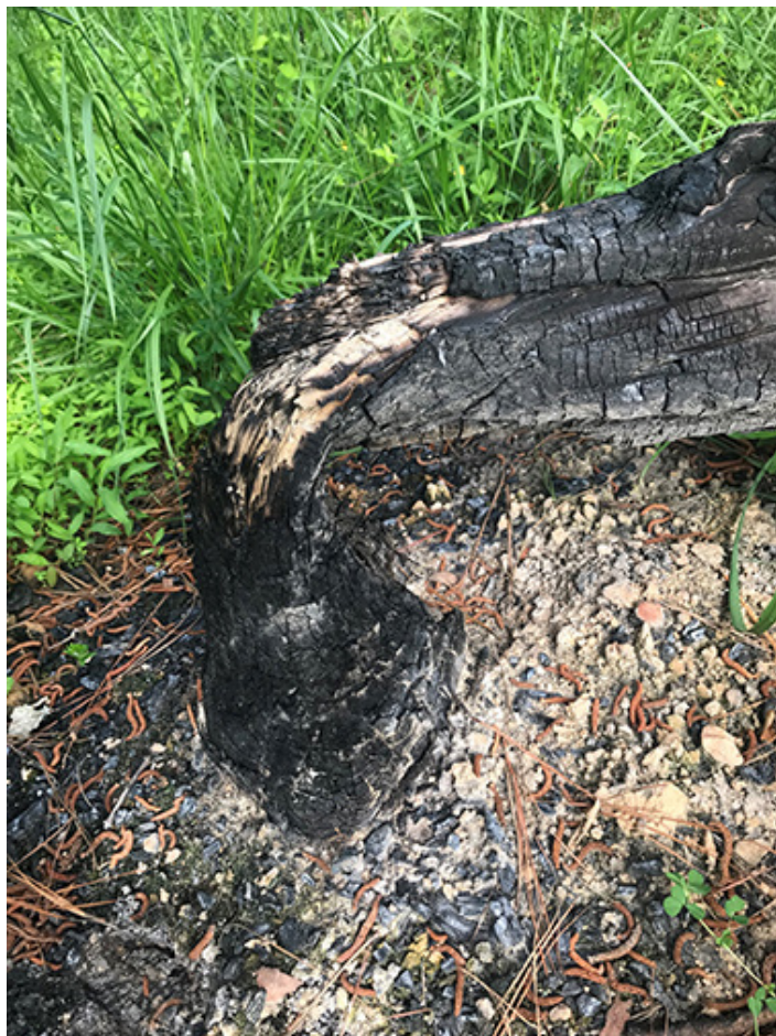
Figure 3. The ash tree burned more easily.