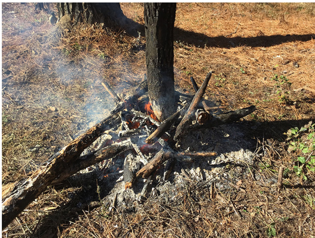
Figure 4 (right). The living pine was difficult to burn.