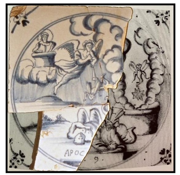
Figure 5. Three fragments mended to show the opening of the Abyss and subsequent plague of locusts from the Apocrypha 9, overlaid on an image of the original tile.

Given the historical information on Dutch tiles and the specifics associated with the fragments from the Eden House archaeological site, several commonalities became apparent. First, all of the tile fragments, as tiles, are attributed to manufacturers in Utrecht. Where Pluis' weighty and extensive tome provides the same thematic images from different tile production centers, the ones from Utrecht are near perfect artistic matches to the Eden House tiles. Secondly, historical examples are all found in the Hannemahuis Museum, which is where Pluis' images of these tiles are likely drawn. Third, all of the tiles contained scriptural references, which means they were likely produced after 1720, the period of Governor Eden's renovation of the Eden House property, including Structure 2. Finally, given the production dates for these tiles, the two tiles depicting the book of Matthew were produced in the third quarter of the 18th century (ca. 1750-1775), later than most of the other tiles. If