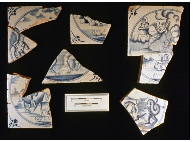
Figure 1: Eleven of the thirteen identifiable decorative, Dutch-made, delftware fireplace tile fragments from the Eden House site.

Historically, Eden House is perhaps best recognized as the location of the dwelling and plantation built by Royal Governor Charles Eden in the early 18th century. Prior to Eden's occupation, however, an earlier late 17th-century settlement was built sometime after 1683 (Lautzenheiser 1998:131). Archaeological investigations revealed that this initial settlement consisted of three earthfast structures and a fence line or stockade (enclosure). The residents of these structures were comparatively affluent, as two of the structures produced evidence of leaded glass windows. One or both of these may have served as an original manor or dwelling house. What was termed Structure 2 by archaeologists also contained fragments of decorative delftware fireplace tiles. Recovered artifacts suggest Structure 2 may have been used initially as a kitchen with a Dutch-style jambless hearth with a brick backwall, wooden frame, and fire-hardened clay (Lautzenheiser 1998:221).