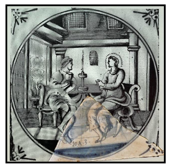
Figure 4. Tile fragment of Jesus teaching Nicodemus from John 3, overlaid on an image of the original tile.

A single tile fragment labeled JOA (a Dutch abbreviation for "John") Book 3, depicts Jesus teaching Nicodemus, a Pharisee of the Jewish Ruling Council (Currid and Chapman 2005:1724). While the tile fragment from Eden House shows only their legs, a duplicate historical tile with matching leg configuration and verse scripture was located in the literature (Figure 4). The historical tile is shown in purple and is attributed also to manufacturers in Utrecht during the first quarter of the 18<sup>th</sup> century. Pluis (1994:422, 829) denotes the image is patterned after engraving #60/21 in Pieter Schutt's Theater of Despair and derived from engraving #16 in Jacobus De Bye's (1598) The Life, Passion and Resurrection of Jesus Christ , which was based on a 1580s drawing by Maarten De Vos found at Gottorf Castle in Schleswig, Germany.