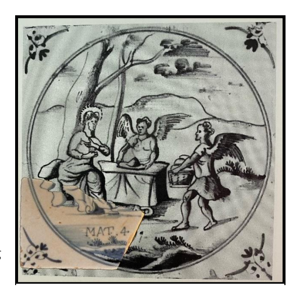
Figure 3. A tile fragment from Matthew 4:11, the end of the temptation of Christ, overlaid on an image of the original tile.

Sacred Histories (ca. 1650). Attributed to Utrecht manufacturers during the third quarter of the 18<sup>th</sup> century, a tile of this image in a dark brownish purple color is currently on display at the Hannemahuis Museum in Harlingen and marked with an "11".