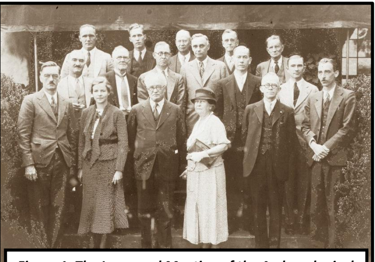
Figure 1: The Inaugural Meeting of the Archaeological Society of North Carolina (October 1933).

On October 7, 1933, the inaugural meeting of the Archaeological Society of North Carolina (i.e., earlier name for the NCAS before it merged with the Friends of North Carolina Archaeology in 1991) was held at