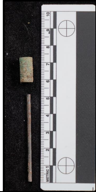
Figures 5-6: Pencil Fragments and a Glass Inkwell