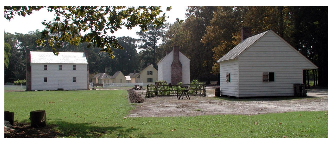
Figure 11-1. Reconstructed slave quarter buildings at Somerset Plantation. In the right foreground is a small slave quarter; in the middle, with its gable end facing the photograph is a large quarter containing four rooms and designed to house four families. At the left side of the photograph is the reconstructed slave hospital.

What has been learned archaeologically about eastern North Carolina's African American past? This paper concentrates on archaeological research done in the last twenty-five years on sites with African American components, with spatial parameters provided by Phelps' definition of Coastal Plain, encompassing 30 counties (Phelps 1983:3). Evidence was found of 41 sites, spread over 15 counties, with definite or likely African American components (Figure 11-1). Another 18 sites, from 8 counties, may contain African American components, unidentified as such in the reports. Sites fell within four primary categories: domestic (either slave quarters or late nineteenth- and early twentieth-century tenant houses), freedman's communities, cemeteries and places of work. The scope of work at all these sites varied, ranging from limited identification-level surveys to intensive excavation and analysis. The limited number of sites recorded, the range of site types, and the varying degrees to which these sites have been explored did not allow for the emergence of any patterns.