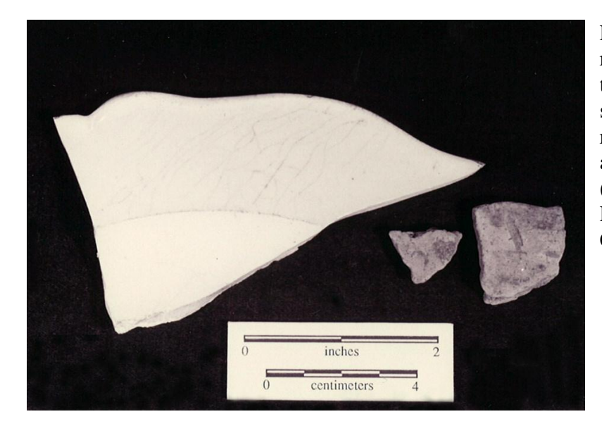
Figure 11-2. On the left is a royal rim creamware plate and to the right are two colonoware sherds showing the same royal rim shape. All three fragments are from the Neils Eddy site (31CB88) in Columbus County.

overseer's dwelling at Neils Eddy (Figure 11-2) and a similarly shaped plate was recovered from Brunswick Town (Lautzenheiser et al. 1997:89; Loftfield and Stoner 1997:8). As in Virginia, colonoware rarely forms more than 5% of a site's total ceramic assemblage (Carnes-McNaughton and Beaman 2005). One notable exception was the quarter at the Hobson-Stone House (31BR187), where colonoware comprised 54% of the structure's ceramic assemblage (Madsen et al. 2002:45). Its presence around the plantation kitchen indicated the use of colonoware by enslaved cooks in meal preparation for the Stone family. Because it was found in such sizeable quantities at this site, colonoware may have been produced there. Stanley South, first encountering colonoware at Brunswick Town, believed this ceramic was produced by Native Americans and traded to colonists (South 1977), while other scholars feel that it was produced by enslaved people of African descent. Colonowares embody the multicultural nature of North Carolina's plantations, where cultural traditions from West and Central Africa, Europe and the native peoples of the region interacted to create new societies based in shared cultural ideas.