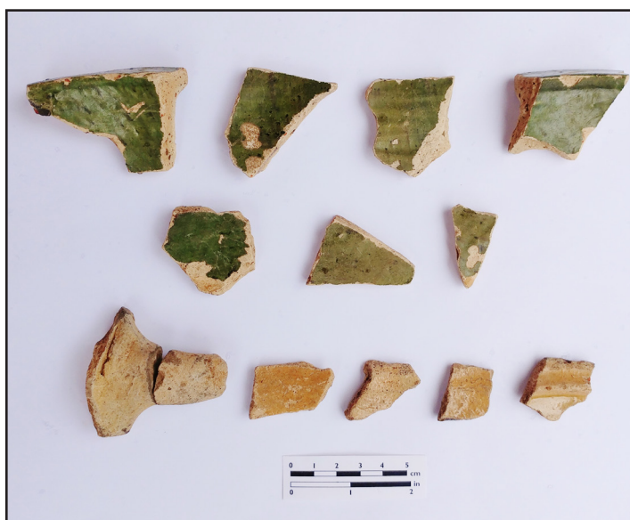
Figure 1.4. Surry-Hampshire border ware sherds recovered from Site X.

continued from page 2, Salmon Creek State Natural Area