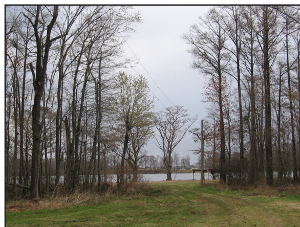
Figure 1.1. Overview of Site X, looking south toward Salmon Creek.