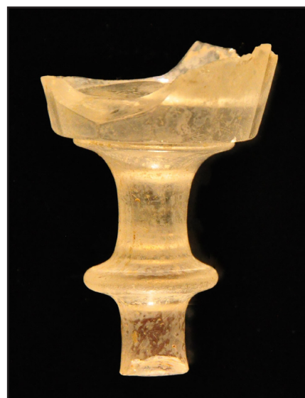
Figure 3.4. Wine glass with 12 pressed panels (1850-1910). Fragment measures about 5.5 cm in height.