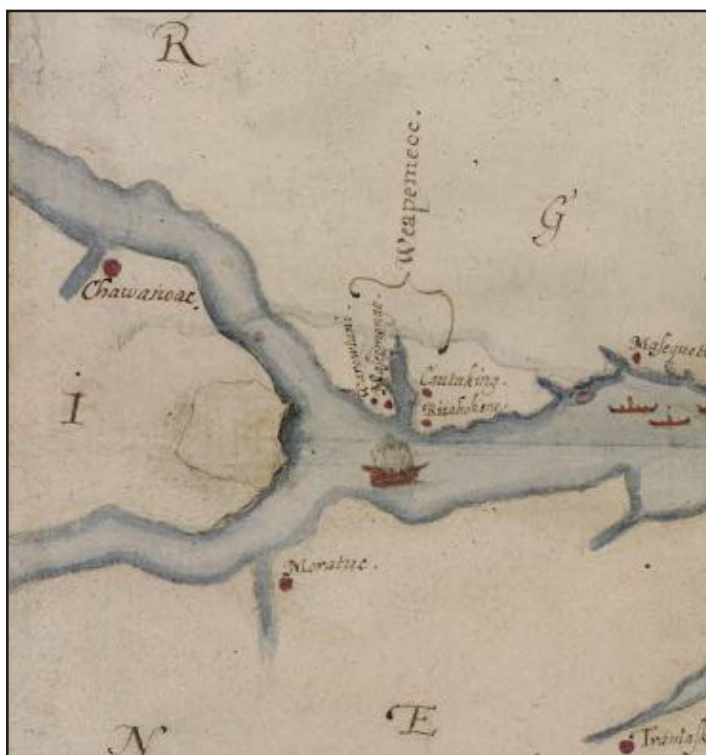
Figure 1.3. Excerpt from John White's ca. 1585-1587 map, showing the patch covering the “fort” at Site X.

continued from page 2, Salmon Creek State Natural Area