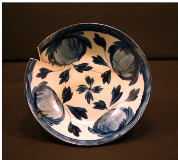
Figure 2.2. Shallow saucer dated ca. 1810-1830 with a blue hand-painted floral design and impressed maker's mark on base (spread-eagle, marked “William Adams warranted—”).