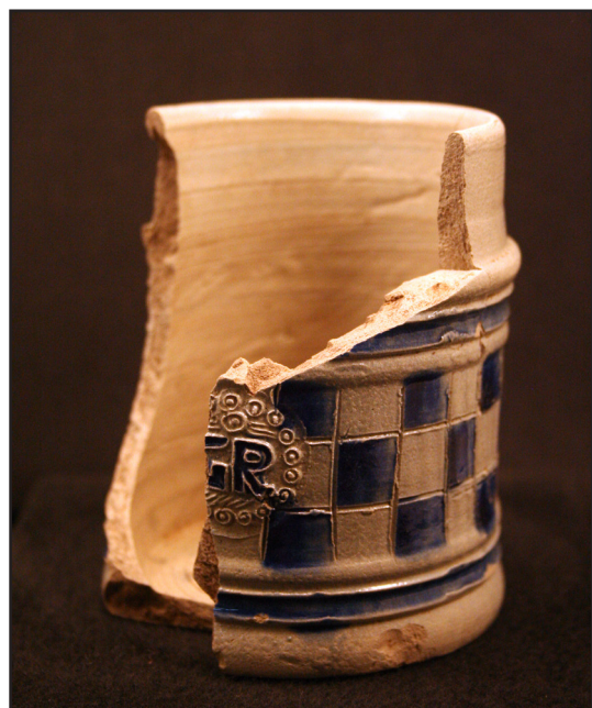
Figure 2.1. Gray salt-glazed stoneware vessel dated to the 1700s with a checkerboard motif and impressed “GR” medallion on band and capacity mark.

continued from page 2, Archaeology at River Bridge Exhibit