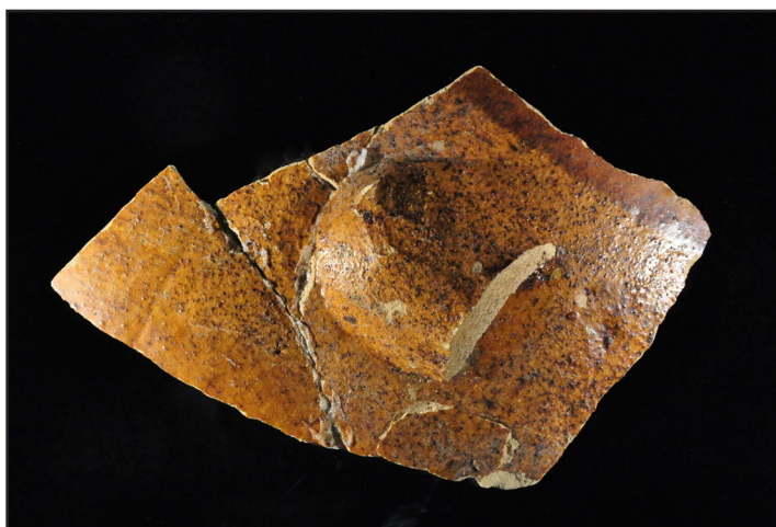
Figure 3.1. Fragment of a manganese mottled, refined earthenware mug (1680-1750). Sherd measures about 10 cm in width.

The artifacts from Lot 55 tell us about a long period of occupation from prehistory to the twentieth century, with the most intense use occurring between the eighteenth and twentieth centuries. Four prehistoric artifacts are present in this collection: three tertiary flakes and one rose quartz bi-face. The historic artifacts consist mostly of ceramic objects, but also include bottles, nails, animal bones (mostly cow and pig), tobacco pipes, hardware, and per-