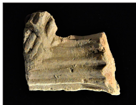
Figure 3.2. Moravian pipe, anthropomorphic style (1770-1840). Fragment measures about 3 cm in width.