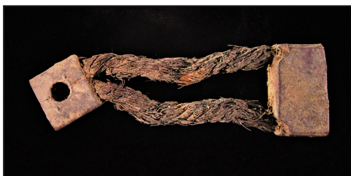
Figure 3.3. Electric brush to a motor (twentieth century). Object measures about 6.5 cm in length.